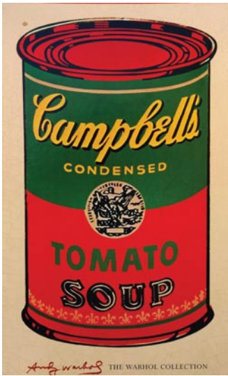
BEIGE SOUP, 24 x 38