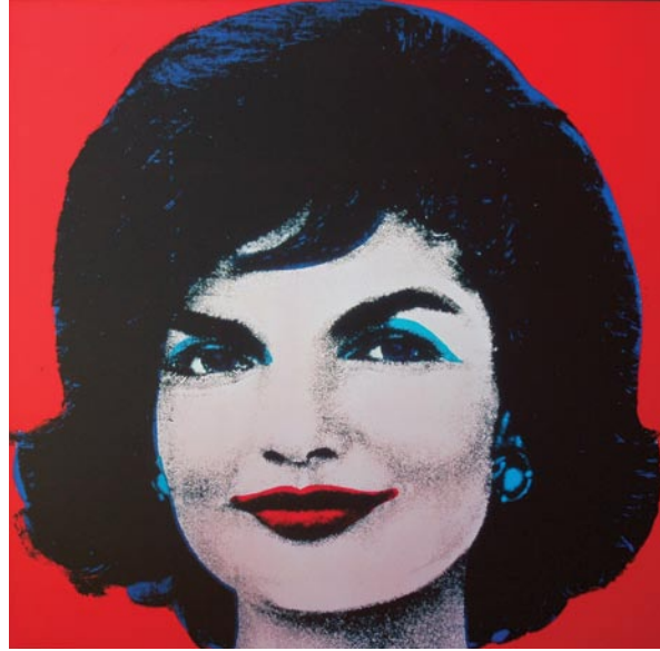
JACKIE, 140 x 40