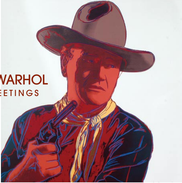
JOHN WAYNE, 40 x 40