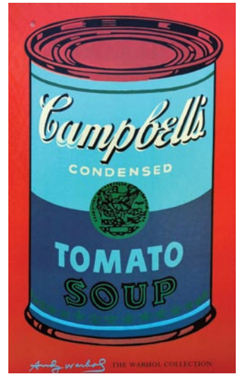
RED SOUP, 24 x 38