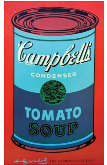
RED SOUP, 24 x 38